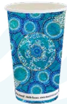
16oz 490ml 86.5mm rim