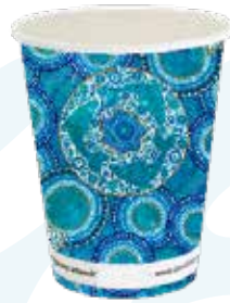
12oz 380ml 86.5mm rim