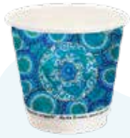
8oz 280ml 86.5mm rim

Stock availability will vary between each state.